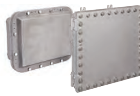
NEMA 7 enclosures