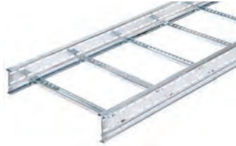
Metallic cable tray and ladder