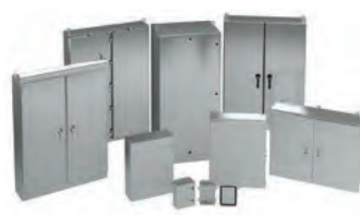
NEMA 4/4X enclosures