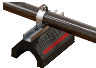
Dura-Blok™ rooftop supports