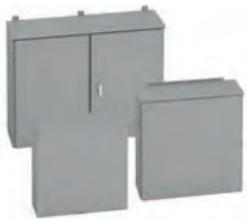
NEMA 3/3R enclosures